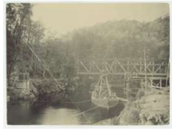
Figure 12 Launching of Iron Bridge with winching cables visible on the truss and barge (Archives of Tasmania)